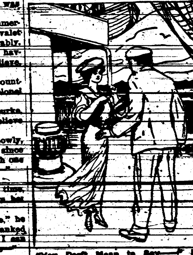
Illustration of a woman in a long dress, possibly related to the story.